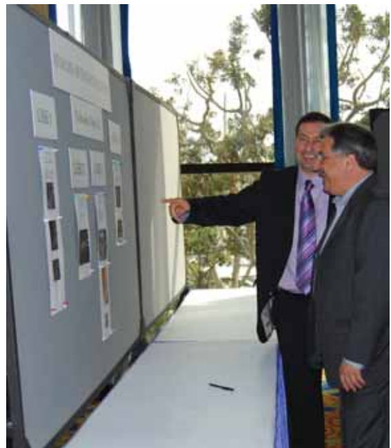
Case-of-the-Day challenge board